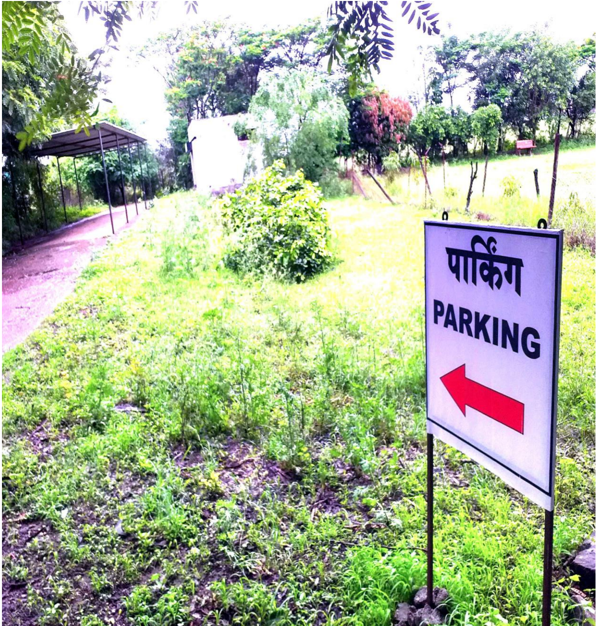
Parking Sign Board