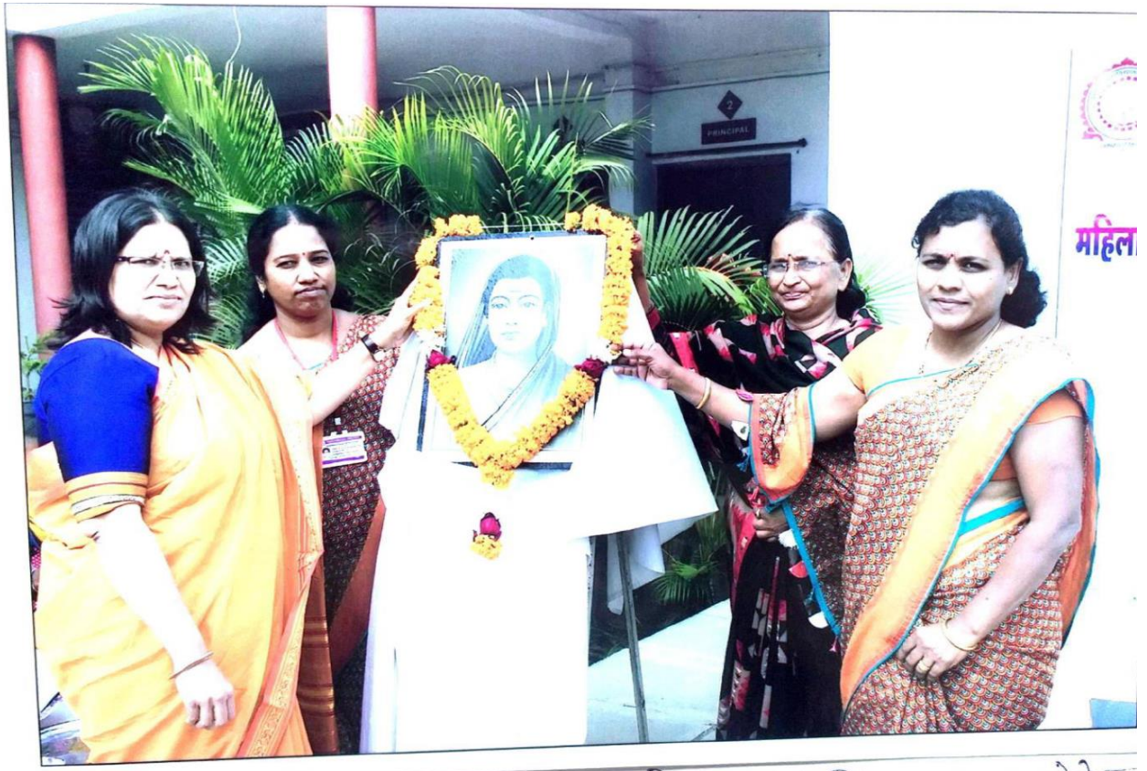
महिला सक्षमीकरण व मानवी हक्क तक्रार समिती