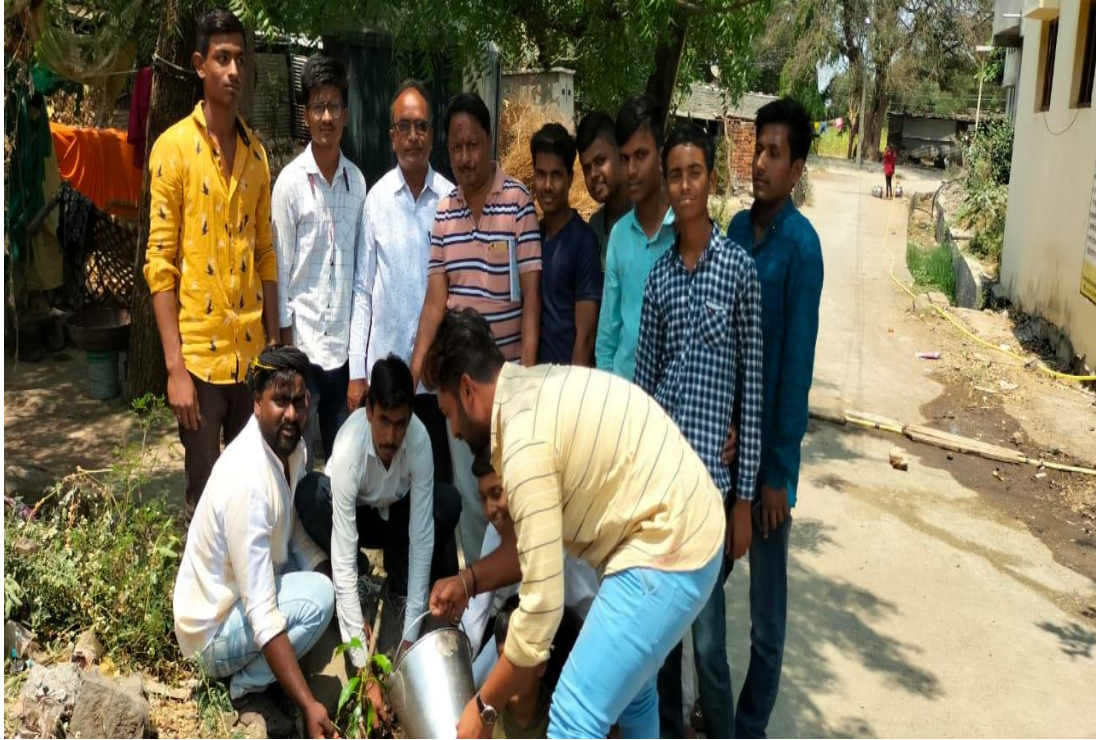
Tree Plantation Activities beyond the Campus