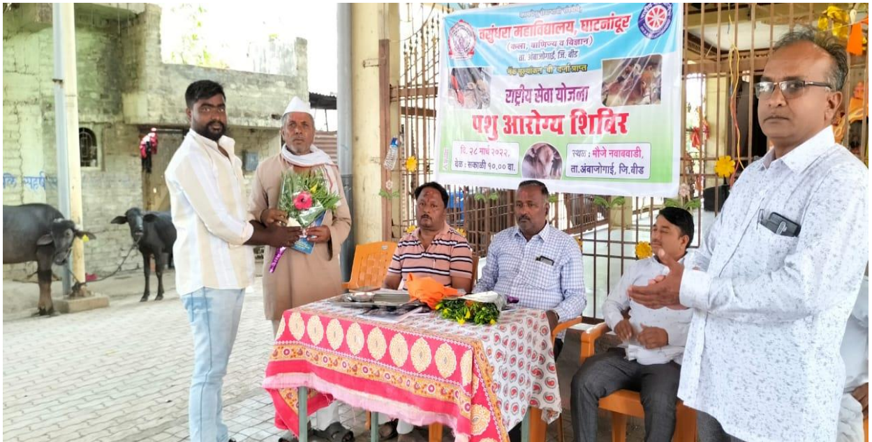
Animal Health Camp