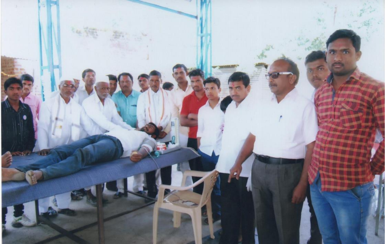
Blood Donation and Covid Vaccination in the Institution