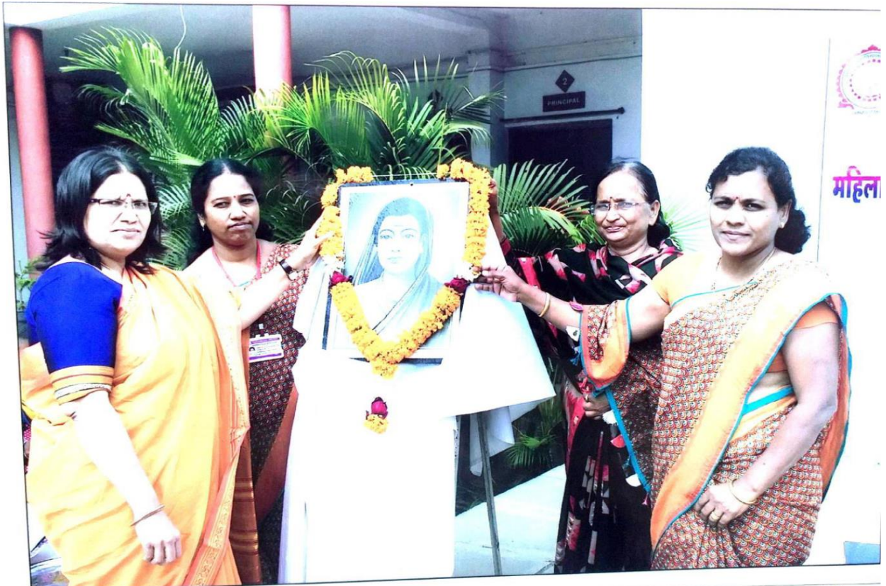
Kshan Anandache Sammelan SasuSunche